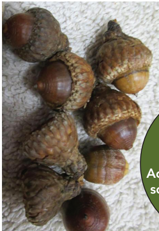
Figure 4: Scarlet oak acorns are fairly small with caps that cover about half of the acorn.

The acorns are a half to 1 inch long and somewhat oval in shape, often with concentric rings near the tip. The acorn cap which covers about half of the nut has somewhat shiny scales and looks like it has been varnished.