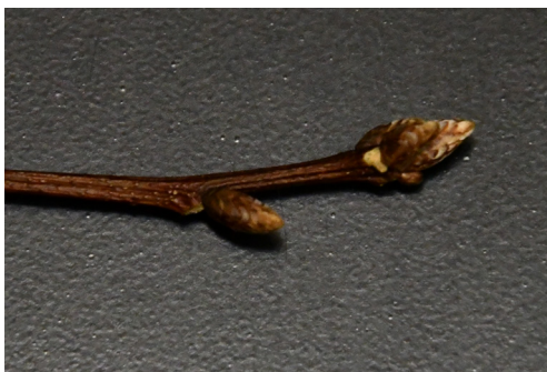
Figure 5: Scarlet oak terminal buds.

Using the twig and buds to identify oaks can be difficult and tricky. However oaks can be distinguished from non-oaks by the characteristic grouping of buds clustered near the tip of the twig. The twig is reddish brown and somewhat slender. The buds are pointed and slightly angled with scales that have a light colored pubescence on the tip.