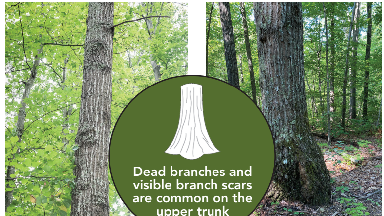
Figure 6: The upper trunk and lower canopy of scarlet oak often have dead branches and visible branch scars due to its lack of self-pruning.