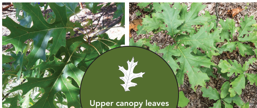
Figure 2: Scarlet oak leaves have much deeper lobes compared to northern red oak.

Upper canopy leaves appear thinner with wide lobes