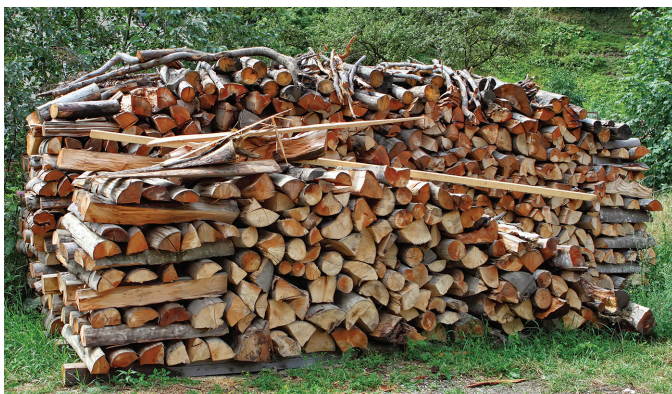
This firewood stack is approximately 1.5 cords.

Firewood is generally measured in cords. One cord is a tightly stacked pile of wood that is eight feet long, four feet wide, and four feet tall. In general, a home will need about 3.5 cords of firewood to survive the winter. A typical woodland can produce about one third of a cord per acre per year if managed sustainably. This means that in order to get that 3.5 cords for every winter, landowners will need a minimum of 10 acres of land. This is an extremely middle of the road estimate since the amount of wood will depend on the heat generated from the wood burned and the type of stove. Wood that is denser can burn hotter and longer than less dense wood. Hickory and Osage-orange can burn hotter than southern yellow pine and basswood. Do not pay attention to “hardwood” or “softwood” labels when selecting wood. Certain hardwoods are dense (hickory) while others are light (birch). The same is true for softwoods.