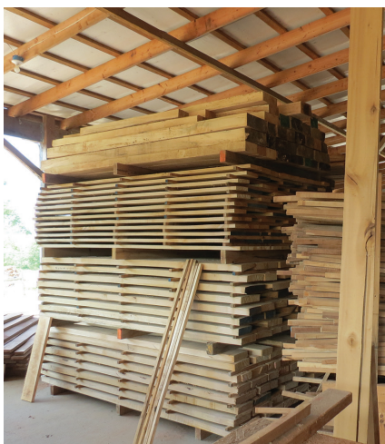
Stack of stickered lumber waiting to be dried in a dry kiln.

After kiln drying, the wood will be checked with a moisture meter to verify the wood is at or below the appropriate moisture content (Table 1). Two readings will be taken per stack of wood: one near the top of the stack and one near the bottom of the stack.