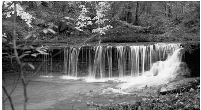
When BMPs are used properly, streams are protected from sediment and debris.

Practices used to prepare a site for planting or regenerating trees. These practices are used to reduce or eliminate unwanted and/or competing vegetation that would threaten the survival or proper development of planted tree seedlings.