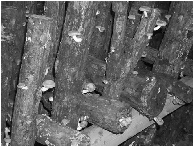
Shiitake mushrooms growing on logs