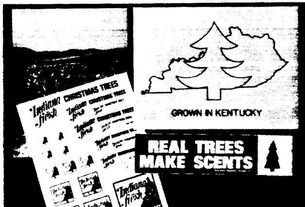
Logos and slogans

have to do it all in one season; do different organizations each year!