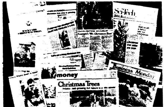
Newspaper articles provide visibility.