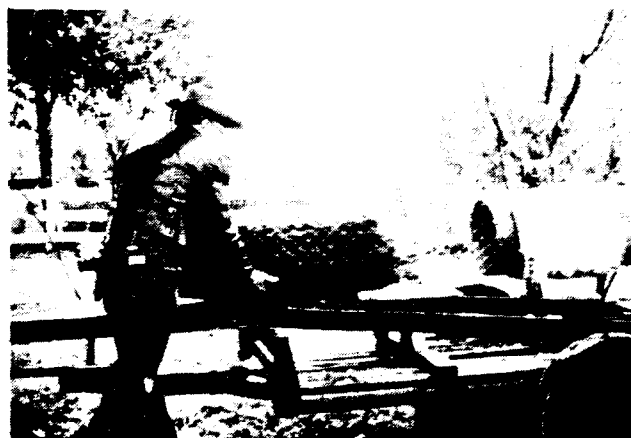
Baling a tree with plastic netting

Planning ahead is still the most crucial aspect of successful Christmas tree marketing. Knowing what your options are, utilizing the media to your advantage, and advertising creatively can make the Christmas tree selling season a most pleasant experience and you can go "ho-ho-ho" all the way to the bank.