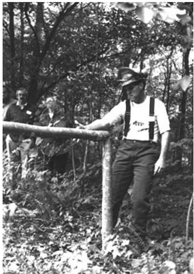
Figure 2. A Tennessee Valley Authority harvesting specialist demonstrates how the open face hinge should operate.