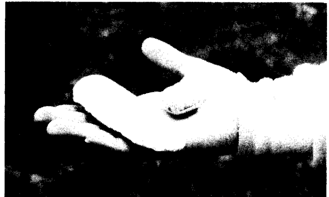
Slow-release fertilizers are used at planting time.

Postplant fertilizer should be applied on a per tree basis, not broadcast on an acre basis. The trees, not grass, weeds, or surrounding ground cover, should be all that is fed.