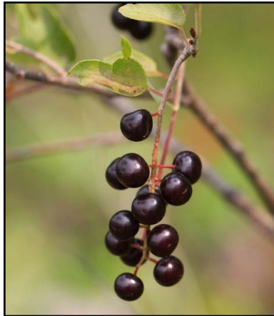
E) Include images of the fruits (if applicable).