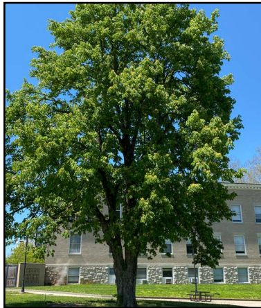
B) Images of the tree form.