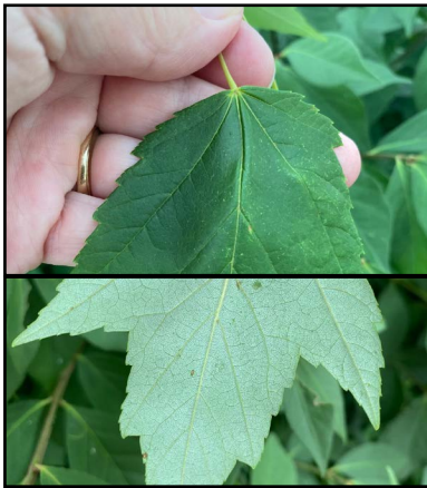
A) Images of the front and the back of the leaf(s).