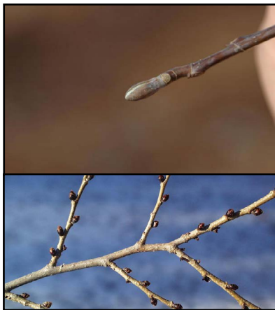
D) Images of the buds (if applicable).