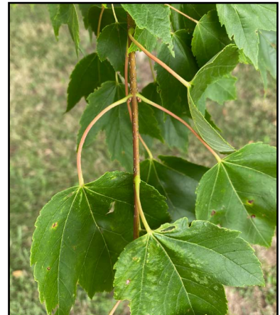
C) Images of the stem and branch.