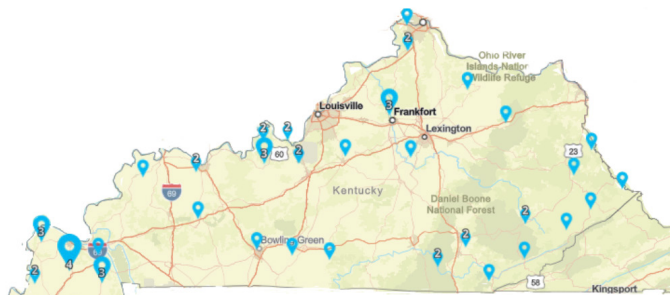
Figure 1. Drop off sites in CWD zone in Kentucky